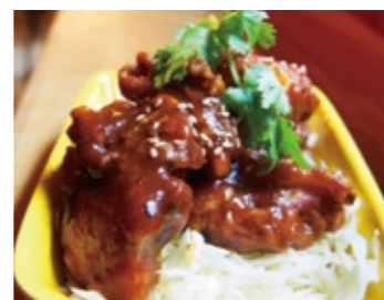
4 Deep-fried Chicken