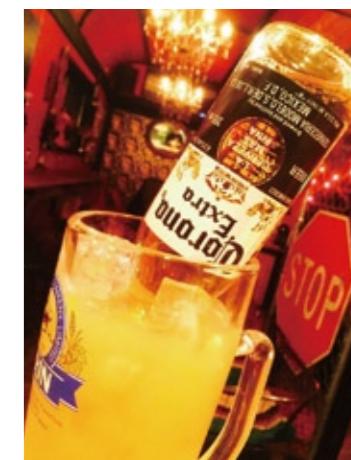
11 Mega Mexican Bulldog