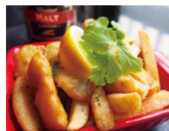
5 Fish & Chips