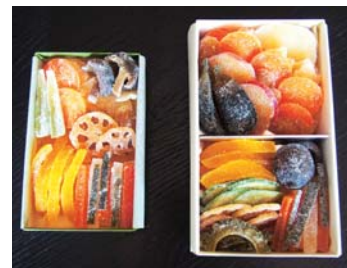
15~21 Vegetable Sweets