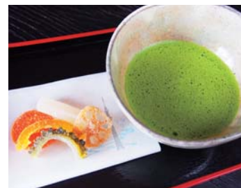
9 Matcha Green Tea