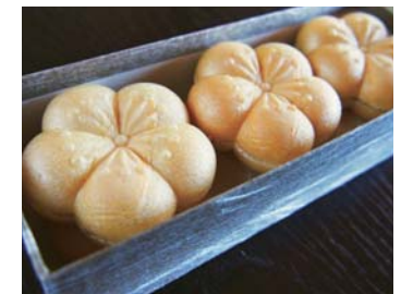
24 25 Kigoto no Hana