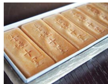
22 23 Bokutei Juuri