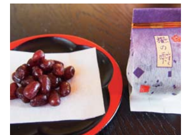
26 27 Kai no Shizuku