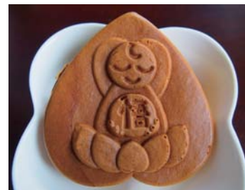
1 2 3 Satoriyaki