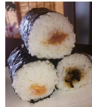
11 Tawara Rice Balls