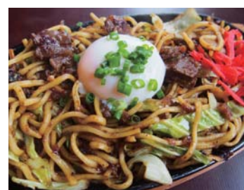
9 Fried Noodles with Simmered Beef Tendons and Konnyaku Jelly